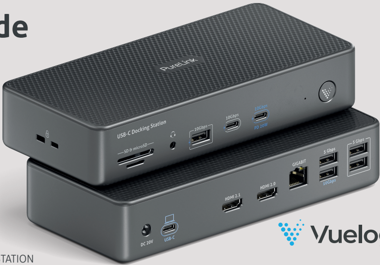
DUAL SCREEN DOCK | 14-IN-1 USB4 DOCKING STATION